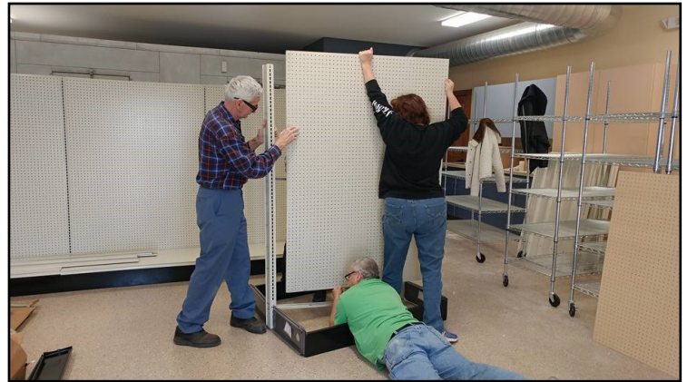
Thank you to all the members and volunteers!

PANTRY LOCATION 821 Industry Rd Sauk City, WI 53583 Phone: 608-571-7737