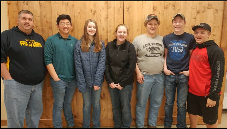
Thank you, Sauk Prairie FFA Members.