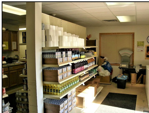
Photo of North Street location. New location photos coming soon.

Over a span of numerous years, the Sauk Prairie Area Food Pantry has experienced a large increase in the value of food distributed. The new site will also offer additional space for frozen and refrigerated items which will be helpful as the pantry receives more donations.