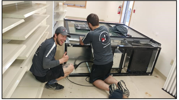
Thank you, Dairyland Moving & Storing LLC.