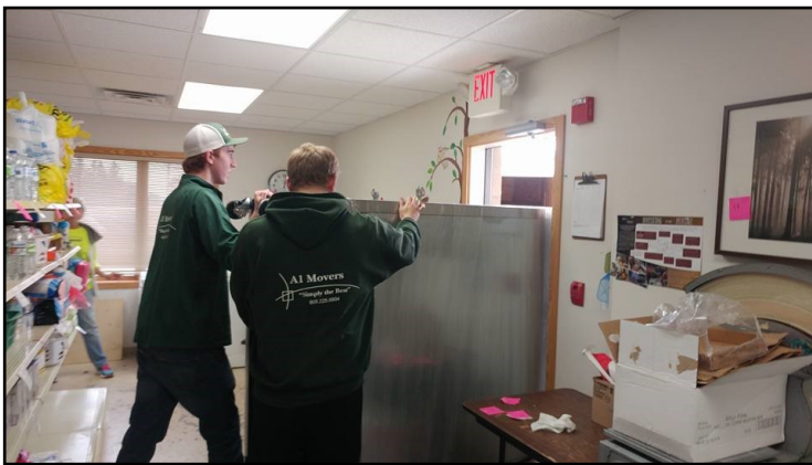
Thank you, A-1 Movers!